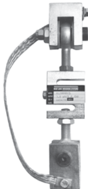
Module with RL20000 S-Beam load cell. Refer to page 115 for load cell specifications.

The ITCM Series utilizes several Rice Lake Weighing Systems components to provide an unmatched level of performance in tank and hopper weighing applications and mechanical scale conversions. The ITCM incorporates clevis and unique rod-end ball joint assemblies to reduce the overall length to less than half of the traditional tension cell mounts, while providing correct load alignment. In addition, the load cell is completely electrically isolated from stray currents, which are a major cause of load cell failure. To complete the design, a grounding strap connects the two clevis assemblies to further provide safety to your load cells.