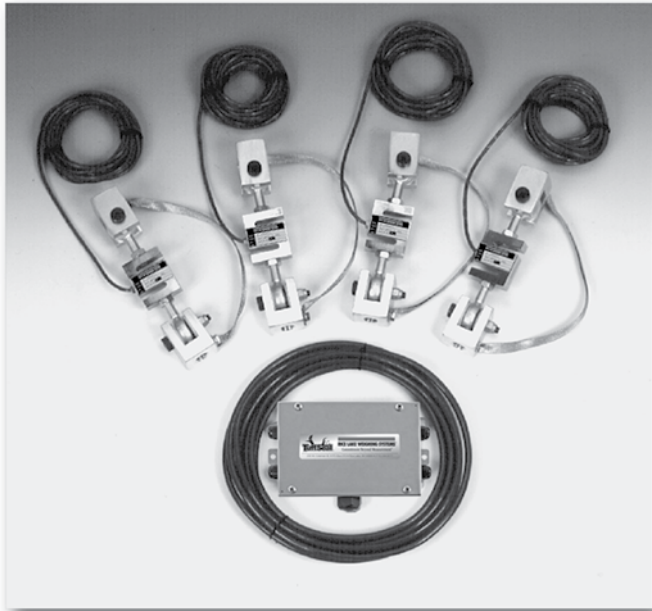
Available in configurations with three or four mounting assemblies. Picture is a representation of actual product

The ITCM Series utilizes several Rice Lake Weighing Systems components to provide an unmatched level of performance in tank and hopper weighing applications and mechanical scale conversions. The ITCM incorporates clevis and unique rod-end ball joint assemblies to reduce the overall length to less than half of the traditional tension cell mounts, while providing correct load alignment. In addition, the load cell is completely electrically isolated from stray currents, which are a major cause of load cell failure. To complete the design, a grounding strap connects the two clevis assemblies to further provide safety to your load cells.